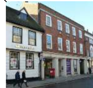
The Bull Inn (Saffron BS)

It was while the bed was in the Bull Inn that it gained the reputation for being haunted.