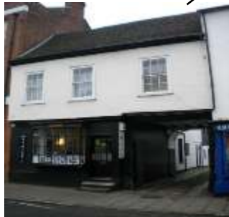
The George Inn

The George Inn was a long and low building running from what is now Lloyds TSB to George Yard.