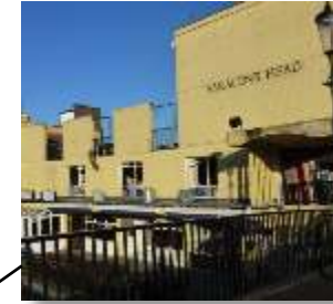
The Saracen's Head

The last inn where the Great Bed resided in Ware was the original Saracen's Head Inn, opposite the bottom of New Road. That was demolished in 1957 and the replacement Saracen's Head was built overlooking the river.