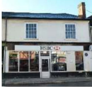
The White Hart Inn

This was one of the oldest inns in Ware – named the ‘White Hart’ after the badge of Joan, ‘the Fair Maid of Kent’ who was lady of the manor of Ware and the mother of King Richard II.