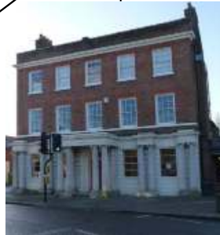
The Crown Inn (Ware Library)

The whole ceremony was, of course, a way of getting a guest to part with even more money.